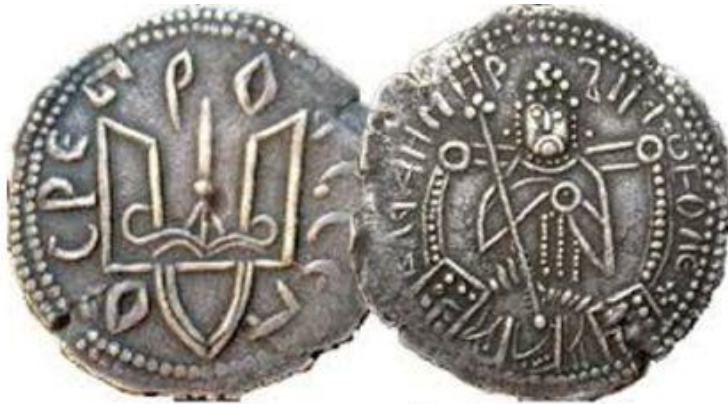
Coins of Rus, 10 th century