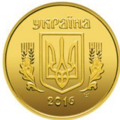
Ukraine coin now