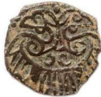
Coins of Golden Horde, 14th century