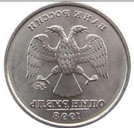
Russian coin now